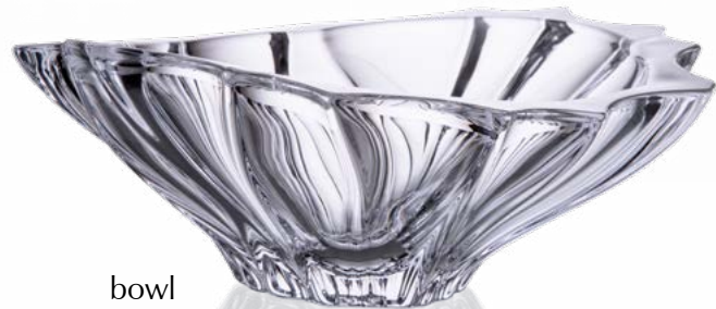
bowl 33 cm