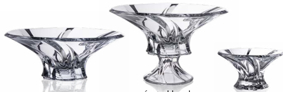
bowl 30,5 cm