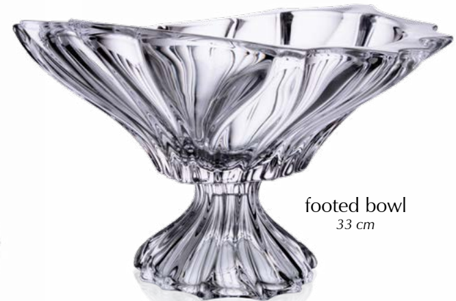
footed bowl 33 cm