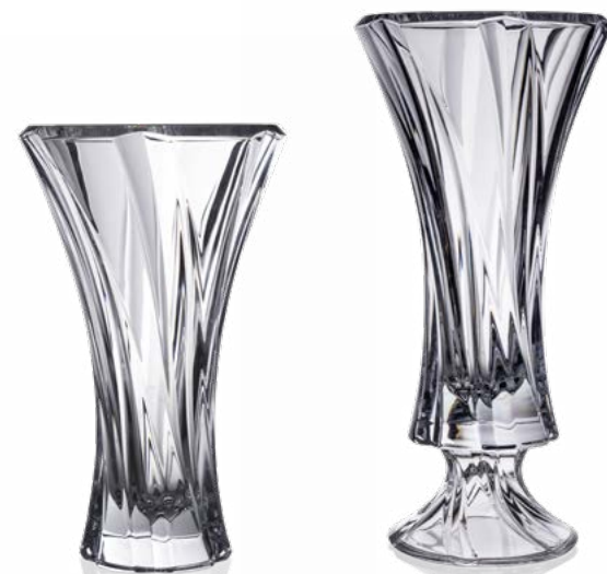
vase 32 cm