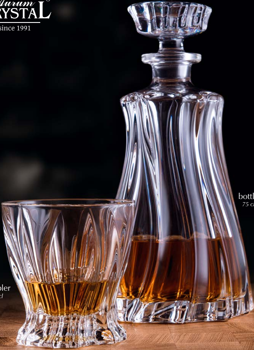
bottle 75 cl