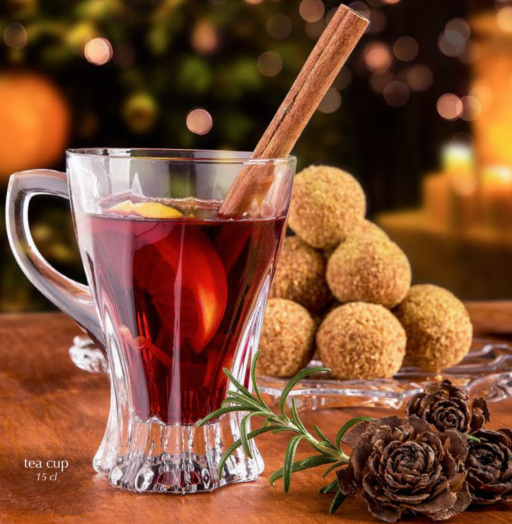
tea cup 15 cl