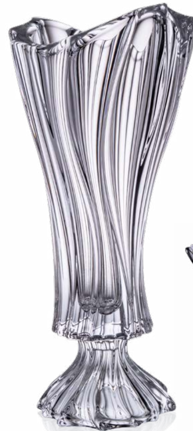
footed vase 40 cm