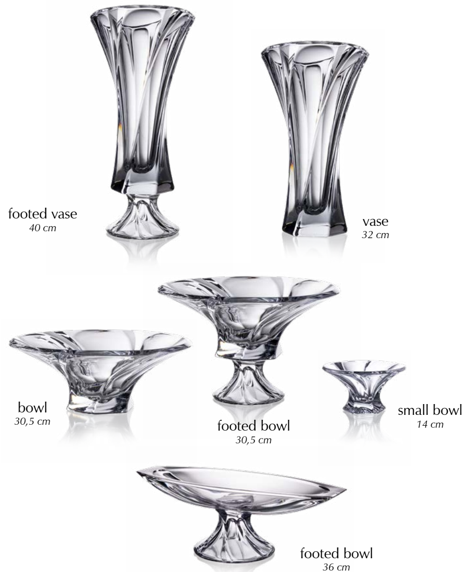
footed vase 40 cm