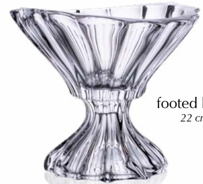
footed bowl 22 cm