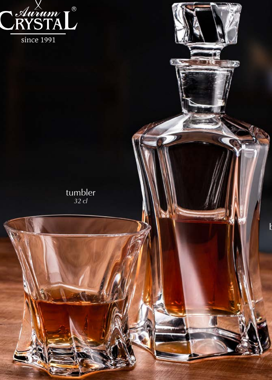
tumbler 32 cl