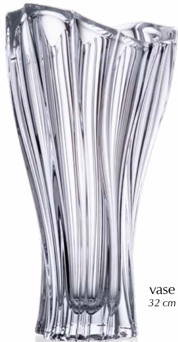
vase 32 cm