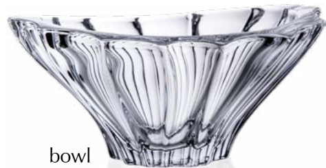
bowl 22 cm