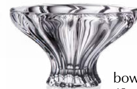
bowl 15 cm