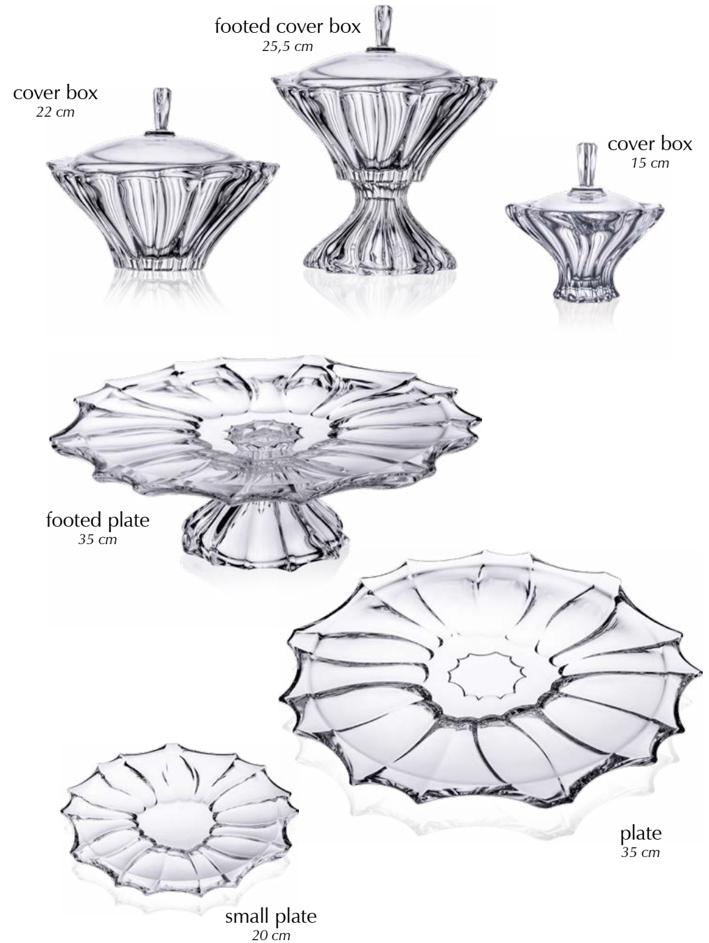
footed cover box 25,5 cm